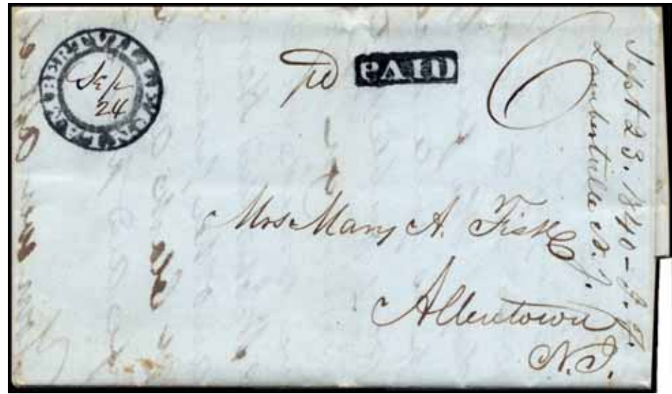
Fig. 7: Negative "PAID" handstamp, single letter rate not over 30 miles on 1840 cover to Allentown, New Jersey.

A second cover with the "PAID" negative handstamp is recorded on a March 6, 1840 cover to Flemington.