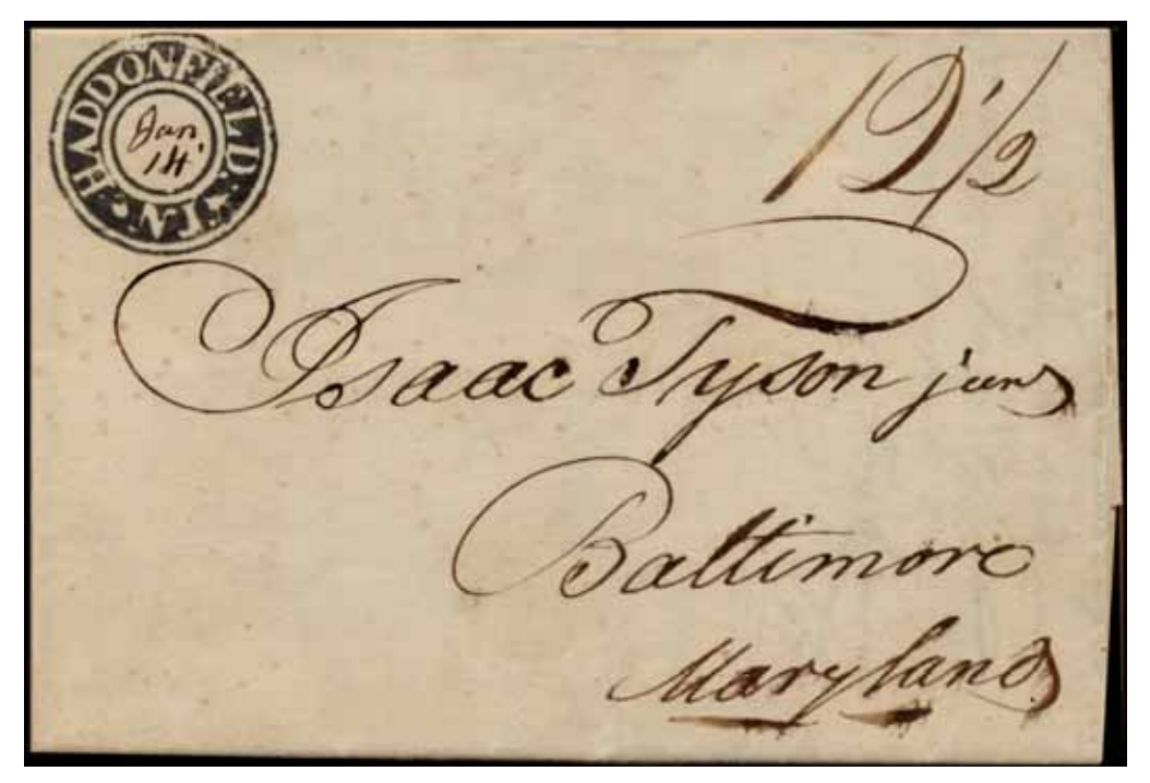
Fig. 4: Single letter rate 80-150 miles on 1842 cover to Baltimore, sent unpaid.

Lambertville was the second of the New Jersey towns to use a negative lettered postmark, from 1835 to 1841. Although Coles recorded "not over five" covers with this handstamp,<sup>3</sup> auction sales in the years following publication of his study record a few additional examples.