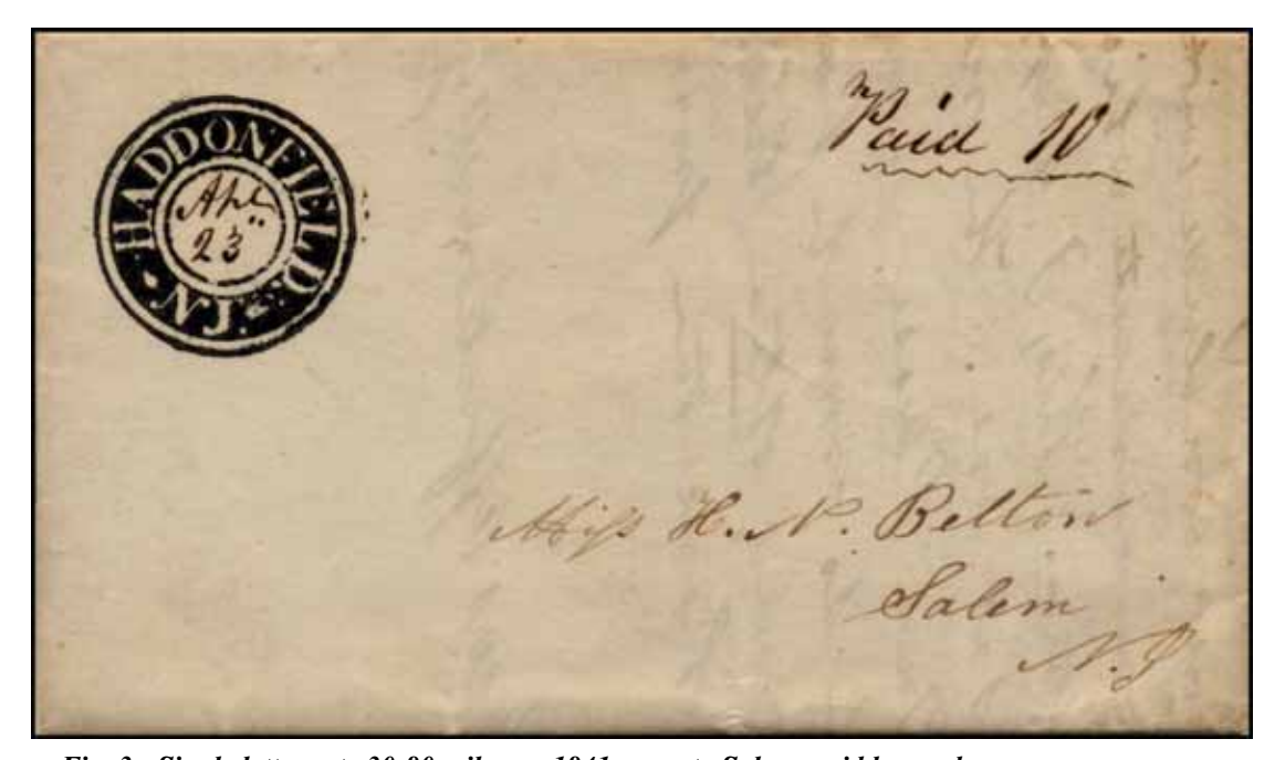
Fig. 3: Single letter rate 30-80 miles on 1841 cover to Salem, paid by sender.

Haddonfield used its negative postmark from 1840 until 1853, including a few covers used with the 3 cent 1851 Issue. William C. Coles, Jr., writing in The Postal Markings of New Jersey Stampless Covers , described this postmark as "one of the most sought after circular strikes, not only in New Jersey but of all stampless covers."<sup>2</sup>