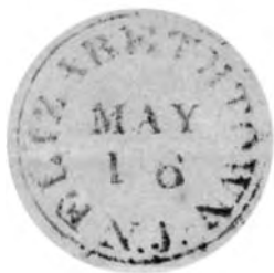
Elizabethtown E10 – Coles 1840-57

The second Elizabethtown postmark is a 31 millimeter circle in black (E11) with reported uses from 1853 to 1855 as shown in Figure 4 4 on the following page. Three cents paid the compulsory prepaid rate for one-half ounce domestic mail under 3,000 miles that became effective on April 4, 1855, just four days before the posting of this cover.