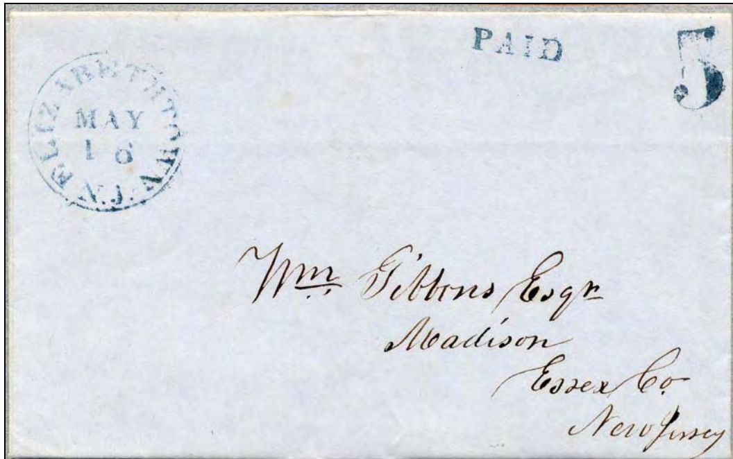
Fig. 3: Elizabethtown postmark in blue with matching “PAID” and “5” on 1846 cover to Madison, New Jersey, Coles type E10.

The question then arises: which of the existing Elizabethtown handstamps was altered to read “Elizabeth?” The Coles Book includes two possibilities. The first is a 29 millimeter circle in blue (E10) with reported uses from 1840 to 1857, as shown in Figure 3. 3 Five cents paid the half ounce rate under 300 miles, effective on July 1, 1845, on this 1846 cover.