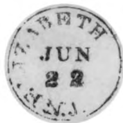
Elizabeth Unlisted postmark - 1855