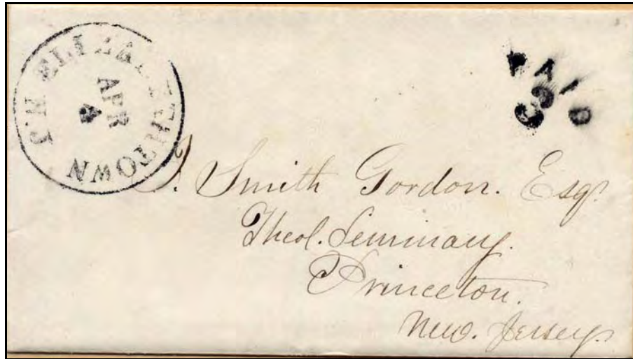
Fig. 4: Elizabethtown postmark in black with matching "PAID 3" on 1855 cover to Princeton, Coles type E11

The altered postmark shown in Figure 2 measures 29 millimeter and the spacing of the letters also matches up with those in Figure 3 , Coles type E10. It appears then, that the type E10 handstamp was altered with the removal of the letters "town" to read as "Elizabeth." The "PAID 3" rate marking is identical to that shown on the 1855 cover in Figure 4 and is the proper rating effective on April 1, 1855.