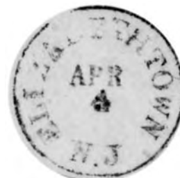
Elizabethtown E11 – Coles 1853-55