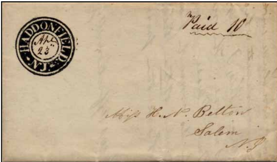
Fig. 3: Single letter rate 30-80 miles on 1841 cover to Salem, paid by sender.

Haddonfield used its negative postmark from 1840 until 1853, including a few covers used with the 3 cent 1851 Issue. William C. Coles, Jr., writing in The Postal Markings of New Jersey Stampless Covers , 1 described this postmark as “one of the most sought after circular strikes, not only in New Jersey but of all stampless covers.” 2