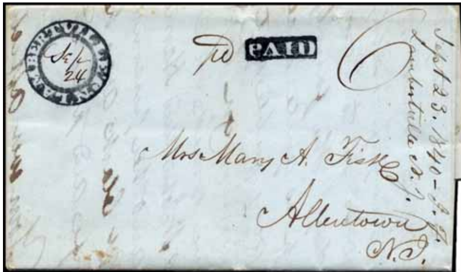
Fig. 7: Negative “PAID” handstamp, single letter rate not over 30 miles on 1840 cover to Allentown, New Jersey.

A second cover with the “PAID” negative handstamp is recorded on a March 6, 1840 cover to Flemington.