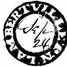
Fig. 2: Lambertville negative cancel, in use 1835-1841.