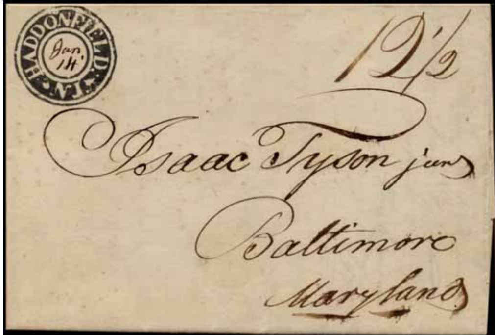
Fig. 4: Single letter rate 80-150 miles on 1842 cover to Baltimore, sent unpaid.

Lambertville was the second of the New Jersey towns to use a negative lettered postmark, from 1835 to 1841. Although Coles recorded “not over five” covers with this handstamp, 3 auction sales in the years following publication of his study record a few additional examples.