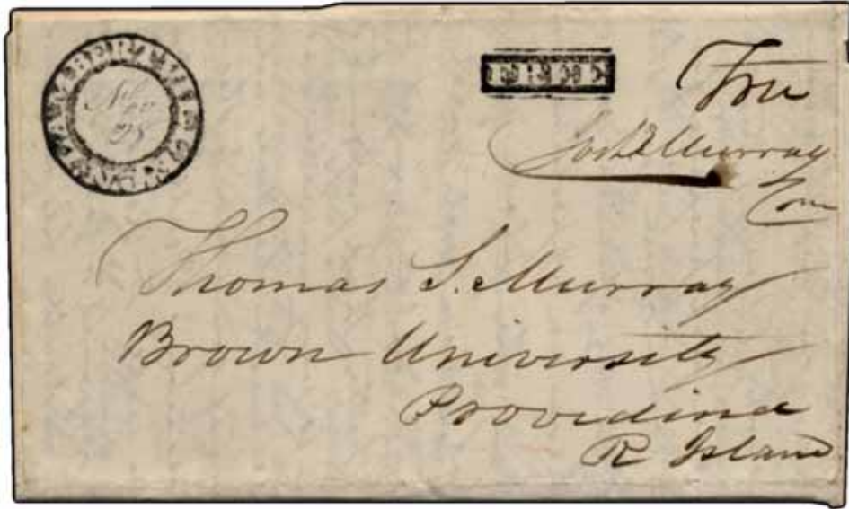
Fig. 6: Negative “FREE” handstamp on 1839 cover to Providence, Rhode Island.