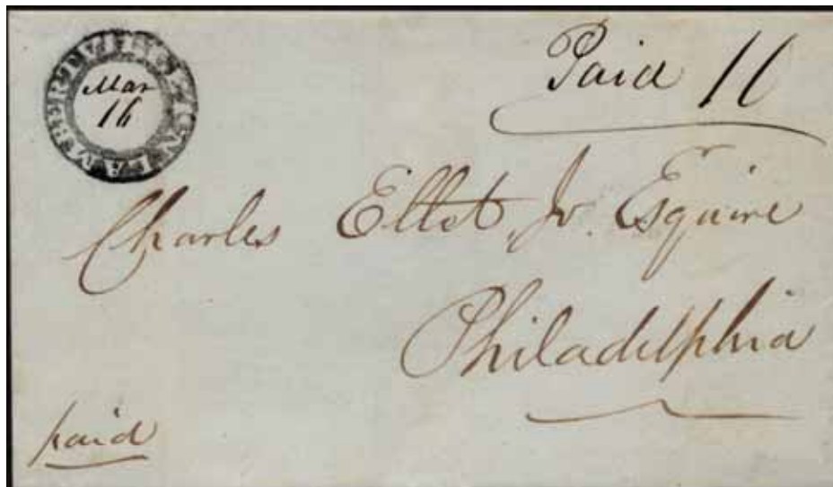
Fig. 5: Single letter rate 30-80 miles on 1841 cover to Philadelphia, sent paid.

Lambertville was the second of the New Jersey towns to use a negative lettered postmark, from 1835 to 1841. Although Coles recorded “not over five” covers with this handstamp, 3 auction sales in the years following publication of his study record a few additional examples.