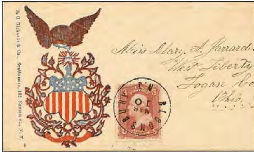
Fig. 6: Cover dated Mar. 10 from Bloomsbury, NJ to West Liberty, Ohio.