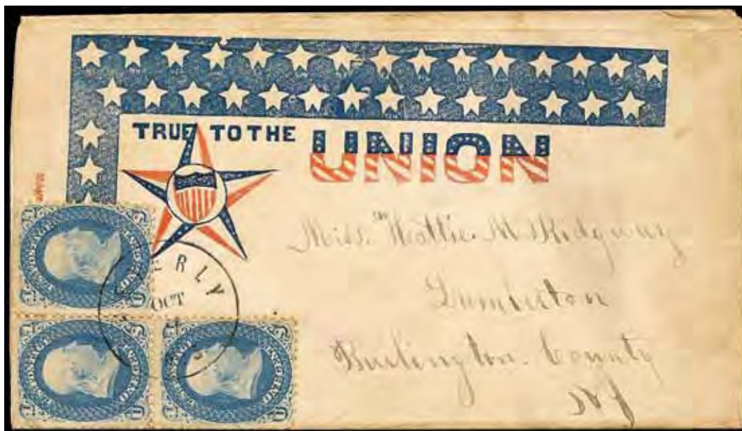
Fig. 5: Cover dated Oct. 9? from Beverly, NJ to Lumberton, Burlington County, NJ.