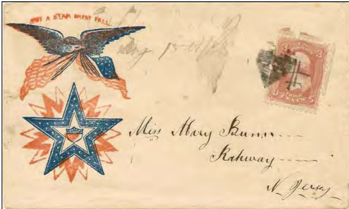
Fig. 3: Cover with a faint Copper Hill manuscript cancel dated Aug. 15, 1863, to Rahway, NJ.

This 1863 writer enclosed a patriotic lettersheet in this envelope.