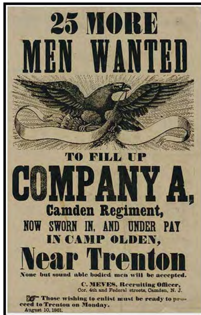
Fig. 1: Recruiting poster for New Jersey Company A.