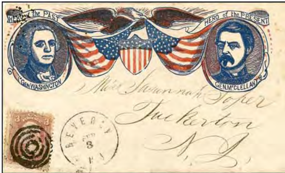
Fig. 4: Patriotic lettersheet dated Sep. 3 from Beverly, NJ to Tuckerton, NJ.