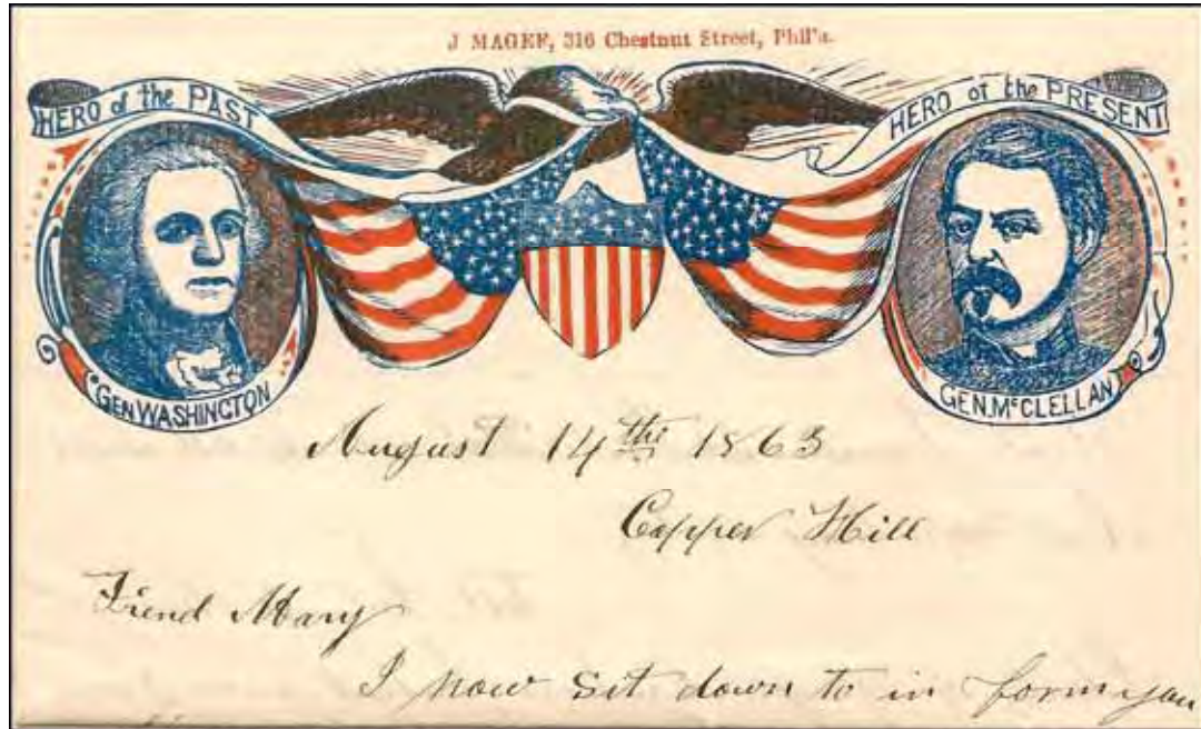
Fig. 2: A patriotic lettersheet dated August 14, 1863, at Copper Hill. This lettersheet was enclosed in the envelope below.