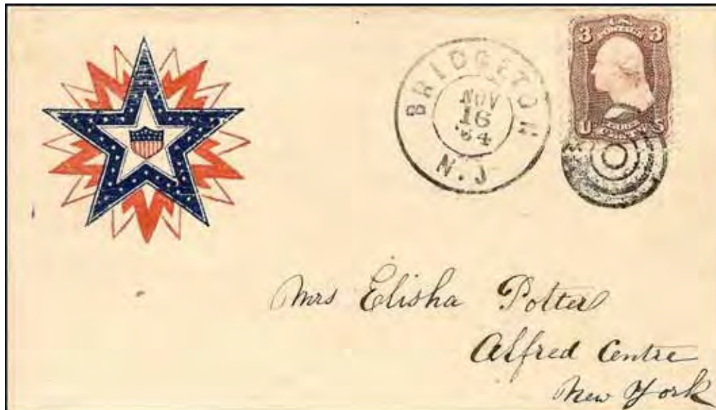
Fig. 7: Cover dated Nov. 16, 1864 from Bridgeton, NJ to Alfred Center, New York.

Come see these and many more New Jersey Civil War covers at NOJEX! Our Annual meeting will be on Sunday May 29th at noon – come join us for an interesting talk, and spend some time with your fellow members. Information on NOJEX is on page 61. We look forward to seeing you there!